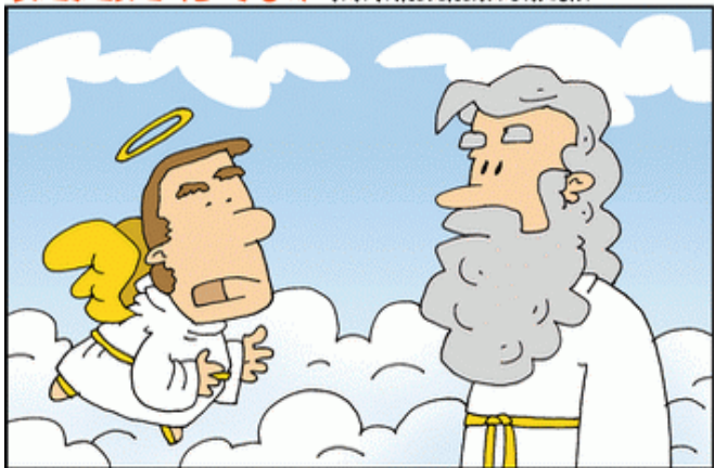
THE KIDS PREFER TO PLAY HIDE AND SEEK WITH SOMEONE WHO IS NOT BOTH OMNIPRESENT AND OMNISCIENT

do not be anxious about anything, BUT in every situation, by prayer and petition, with thanksgiving, present your request to God.