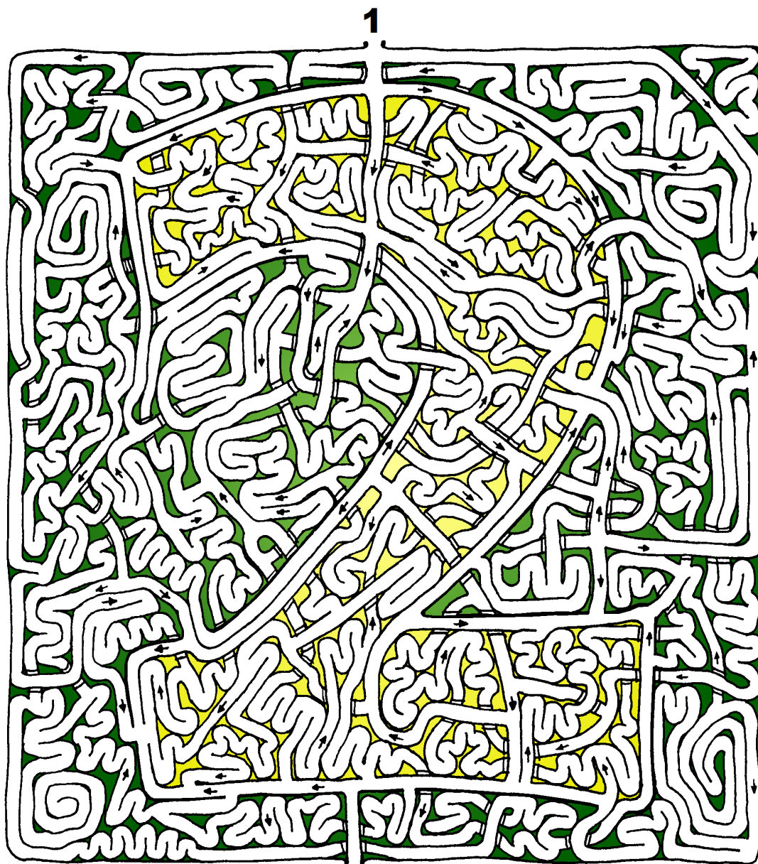
"Maze Two" - by Andrew Bernhardt

This is a two-in-one maze. Find your way from the 1 to the 2 . Then find your way from the 2 back to the 1 . Bridges allow paths to cross without intersecting. Do not go against the arrows.